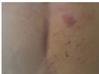
Figure 6: Red area in September 2018

Given I was up and about the day after surgery I was feeling a bit fragile and unable to perform normal pressure relief regime. The Vicair appears to have given the needed protection even though my movements been greatly reduced...I'm extremely happy as you can imagine, attached pics show botty day before surgery and last night!"